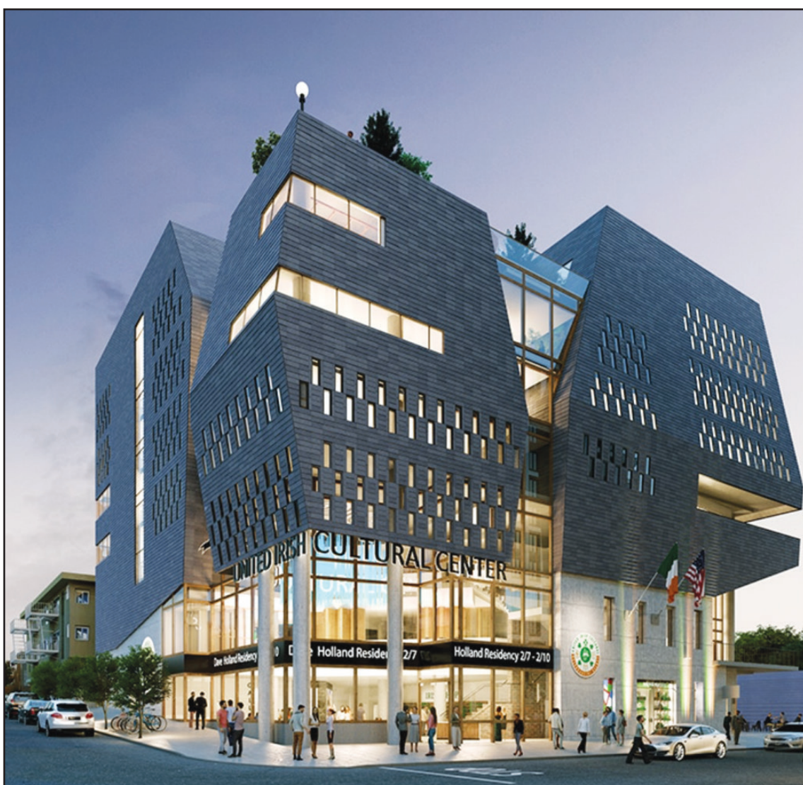
An artist's rendition of the new Irish Center as it will be seen from the corner of 45th Avenue and Wawona Street.